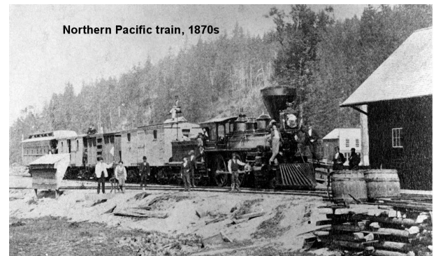
Northern Pacific train, 1870s

road was up the valley of the Spokane River to the town of Rathdrum, twenty-six miles east on the line of the Northern Pacific Railroad, and then 10 miles north through a heavy mountain forest. We had a pair of good, tough, little horses who were used to the long and rapid traveling of this country.... Suddenly and unexpectedly as we turned down a hill, the wall of the thick forest parted and through the opening we could see Spirit Lake nestled quietly and placidly in the embrace of the surrounding mountains....It seemed to me this might not only be the paradise of the fisherman and the hunter, but of the tourist and lover of nature as well, for in this little lake was a gem indeed..."