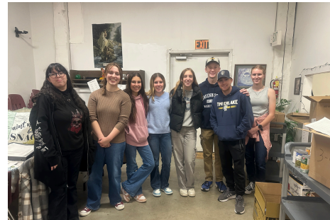
Timberlake Students helping pack food boxes

The Spirit Lake Seahawks Fan Club plans to continue combining football fandom with community service, proving that being a Seahawk isn't just about cheering on Sundays—it's about making a difference all year long.