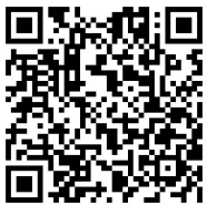
Scan for SLCC Facebook

Submit YOUR calendar dates at www.spiritlakecc.org