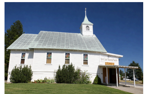
Spirit Lake Idaho Historical Museum

(Book can be purchased at Mrs. C's Trains or at the Museum)