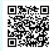
Scan for SLCC Calendar